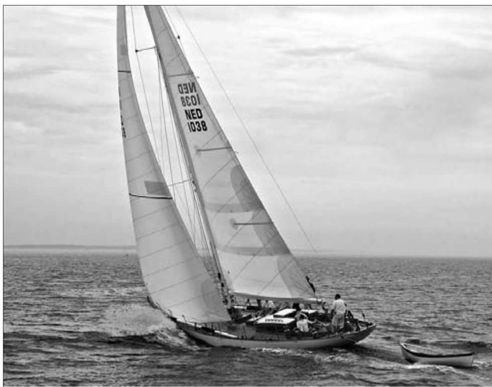
Zwerver , winner of the 2009 Castine Classic Yacht Race.

See the accompanying box for places to view the races.